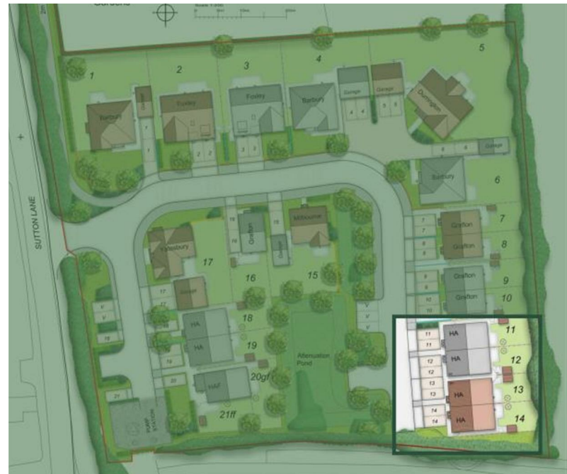
Garden Close, Sutton Benger